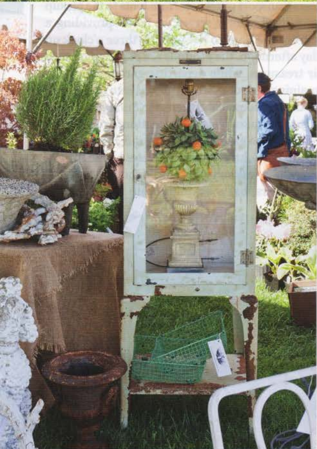
This page, clockwise from above left: Customers browse a colorful grouping of garden ornaments, plant supports, and birdhouses suspended from tree branches. Beneath one of several tents on the property, stacks of wicker baskets and rows of chairs and pottery await perusal. Volunteers whisk purchases to pickup stations. Piles of linen pillows provide comfy accent pieces for outdoor furniture. Surrounded by handcrafted cement planters, an antique apothecary cabinet captivates with Old-World charm.